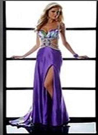
Slit too high - cut out sides showing more than 3 inches