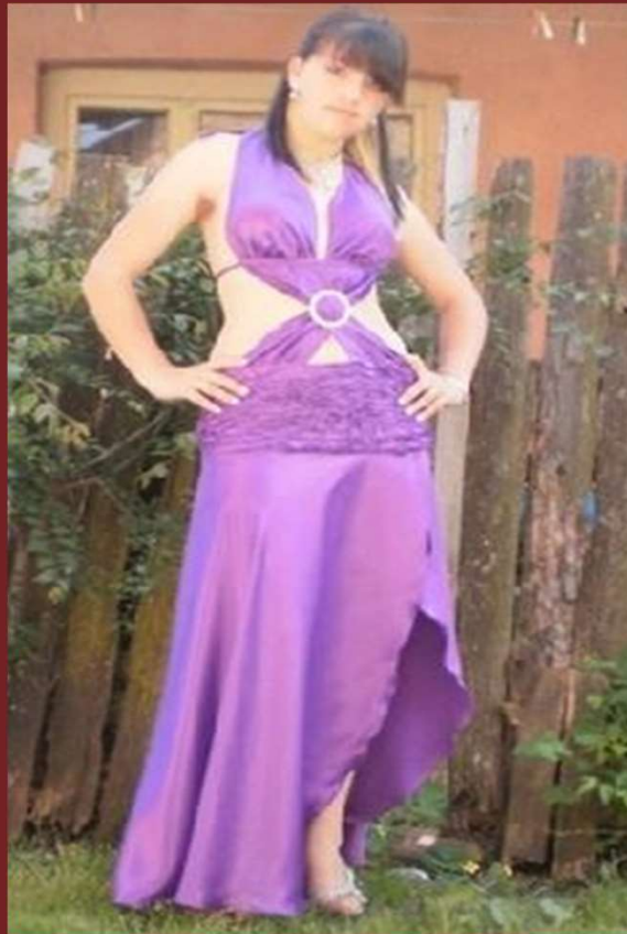
Showing Too-much skin