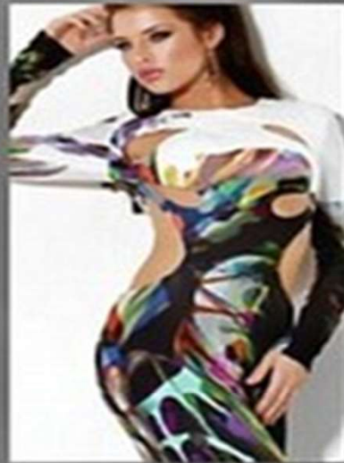
Too many cut outs!